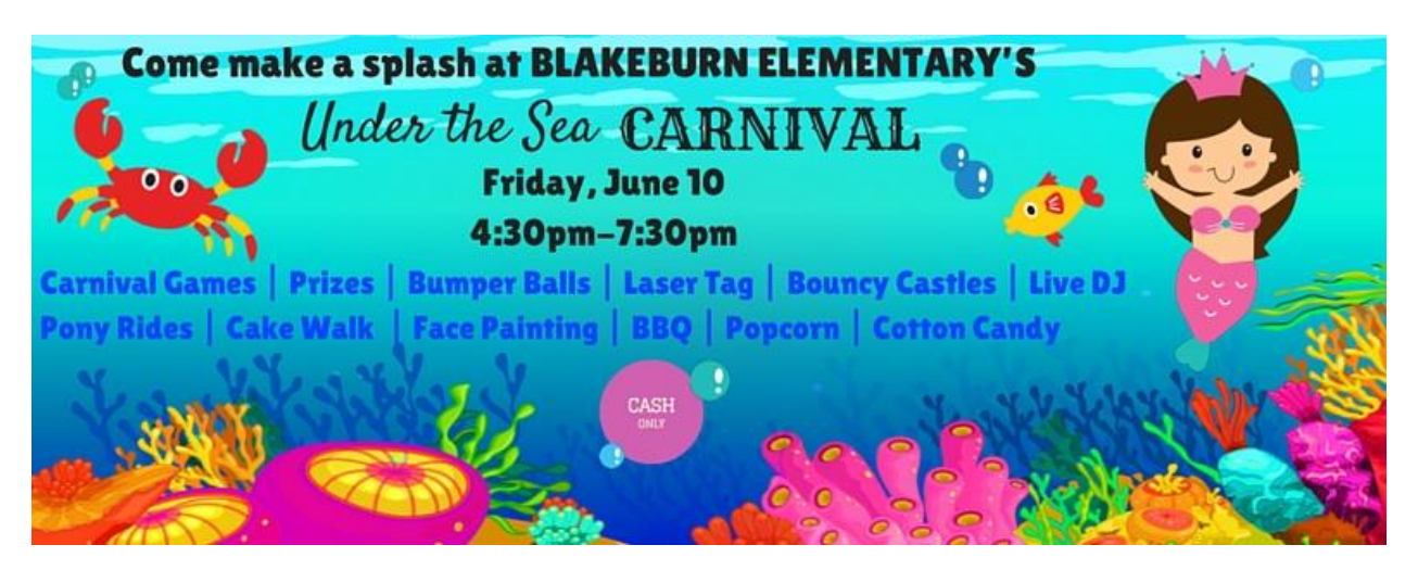
The PAC would like to thank everyone involved who contributed to making Blakeburn's 2016 Carnival a success!

Website: <a href="https://www.blakeburnpac.org">www.blakeburnpac.org</a> Find us on Facebook: "Blakeburn Elementary PAC"